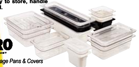
Camwear Food Storage Pans & Covers

Use CW-Pans for storage, transportation and serving display; HP-Pans for microwaves, steamers and ovens and PP-Pans are an economical choice for storing food as well as using on prep tables and in food bars. CW withstand temps -40°F to 210°F; H-Pans -40°F to 350°F and PP-Pans -40°F to 160°F. Add CW to model number for cold pans, HP for hot pans and PP for translucent pans. Cover styles available—seal, flat, flip, grip, w/handle and notched. NSF.