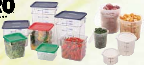
Camwear Food Storage Containers

Food storage containers help you make the most use of your storage area.